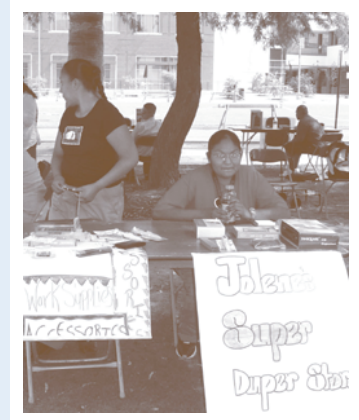
Camp students at youth marketplace.

Applications are being accepted from interested students until June 25. A brochure and application form is available on the NNI website at www.nni.arizona.edu/nayec.htm . For more information (or if you missed the deadline), contact Rose Chischillie at 520.626.0664 or rchischillie@u.arizona.edu .