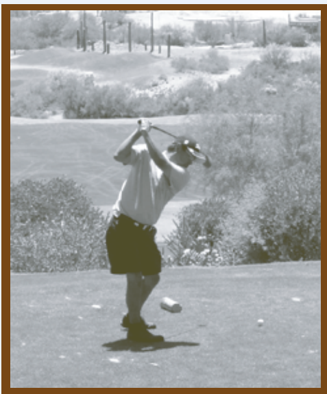
Tournament participant taking a swing.

The third annual Native Nations Institute/Roger Willie Charity Golf Tournament was a great success! NNI would like to thank everyone who contributed to this year's tournament, which was held at Starr Pass Golf Resort on April 30 and May 1, 2004. Winners in the various categories are posted online at www.nni.arizona.edu/2004golf.htm .