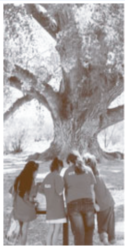
ECOSTART students on a field trip.