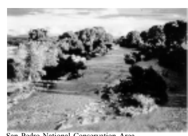
San Pedro National Conservation Area

The study aimed to identify stakeholder perspectives and concerns regarding the water policy and water management in the basin for the use of both local governments