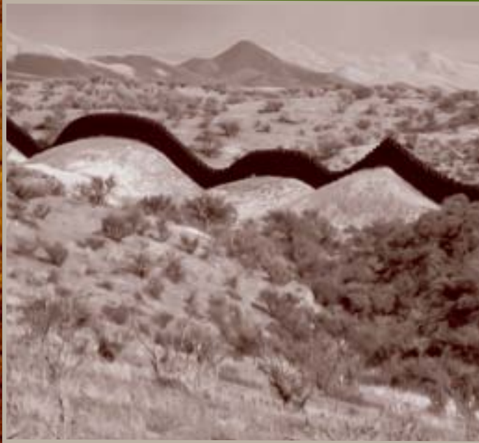
PEDESTRIAN WALL ALONG THE ARIZONA-SONORA BORDER

For the most part ... Native nations have been excluded from border policy processes – from nineteenth-century border-making to twenty-first-century border fencing.