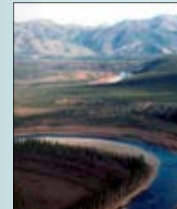
Far North: Alaska's border regions