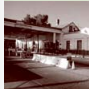
U.S. inspection station at the border between Tecate, California and Baja California, the official Kumeeyaay port of entry