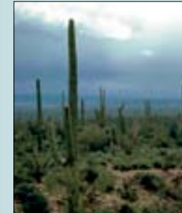
South: U.S. - Mexico border region